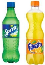
500ml bottle Sprite or Fanta