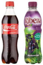
500ml bottle Coca-cola or Ribena